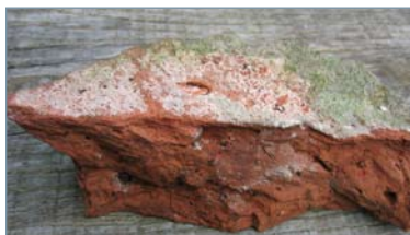
Roman bricks were larger and flatter than modern bricks. This fragment still retains some mortar.

The Saxons built with timber. Fired floor tiles are rare before the 13th century and are found together with re-used Roman brick and tile in high-status buildings such