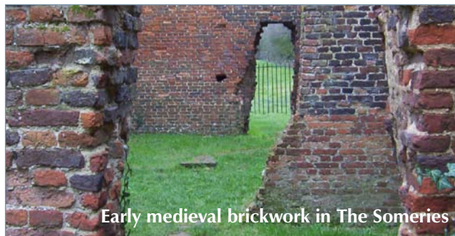
Early medieval brickwork in The Someries

as churches. The earliest post-Roman bricks are 12th century, but The Someries (near Luton) built c. 1448 is still one of the oldest brick buildings in Britain.