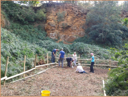
2017: Sandy Warren Lodge Quarry enhancements in progress.

We have completed three new geotrails: Eastern, Central and Western. A new information booklet was also produced. These four items are those mentioned in the previous article. During the summer of 2020, Derek Turner, along with a couple of other volunteers, waymarked the new geotrails making them easier to follow.