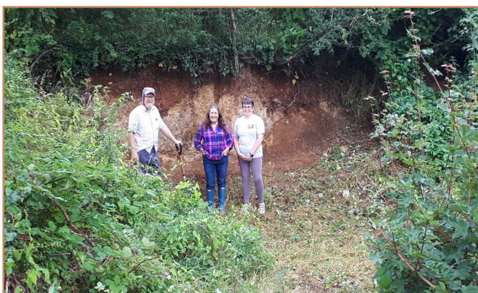
Intrepid clearance crew in front of the newly cleared (July 2021) outcrop of Quaternary gravels.

This old gravel pit provides exposures in terrace gravel laid down by the Bedfordshire Ouse. The deposits include clayey and silty layers, which have yielded interglacial Mollusca and mammalian remains. A prolific Palaeolithic industry has also been identified in the lowest part of the gravels. The combination of Palaeolithic and palaeontological material at this site ensures that the Biddenham pit is of considerable scientific significance.