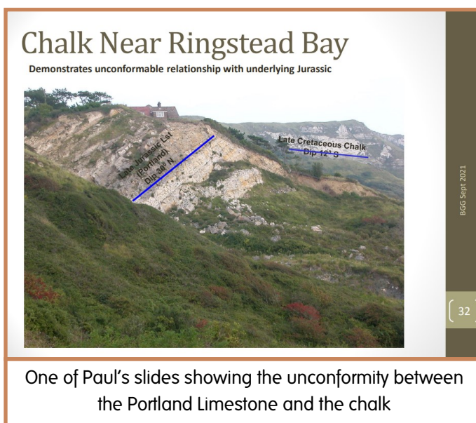
One of Paul's slides showing the unconformity between the Portland Limestone and the chalk

Paul's talk took us on a journey from the Triassic Budleigh Salterton pebble beds in the west through over 200 million years of geological history to the chalk and beyond in the east as the basin bobbed up and down due to continental drift and tectonic pressures. Fresh sediment accumulated on many occasions and erosion occurred at others but a fairly complete sequence of rocks reveal themselves along the coast. Add in the faults that controlled uplift and subsidence and the conditions were right at Kimmeridge for reserves of oil to form and be exploited at Wytch Farm. Many beautiful pictures accompanied the talk and Paul had prepared lots of maps and diagrams to explain what was going on in each. His comments also sparked some lively discussion and we were fortunate to witness a presentation of such quality.