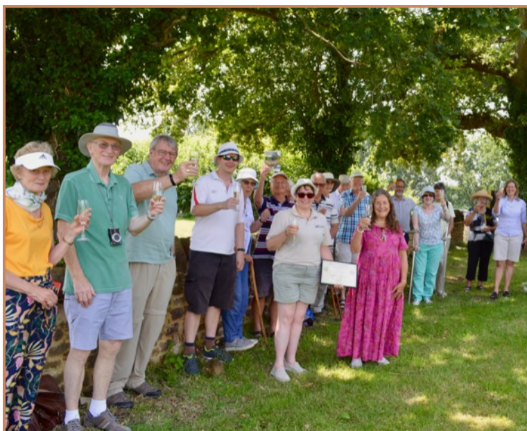
Enjoying a glass of bubbly to celebrate the award.