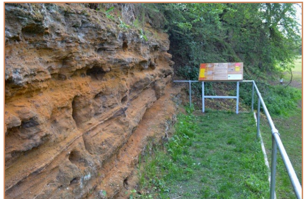
2018/19: Potton Scout Hut Quarry enhancement.

In addition, we have also revealed a new section of the Woburn Sands Formation at Rushmere Country Park, where we also cleared and revealed the old quarry that has 'Dick Turpin's Hideaway' within it.