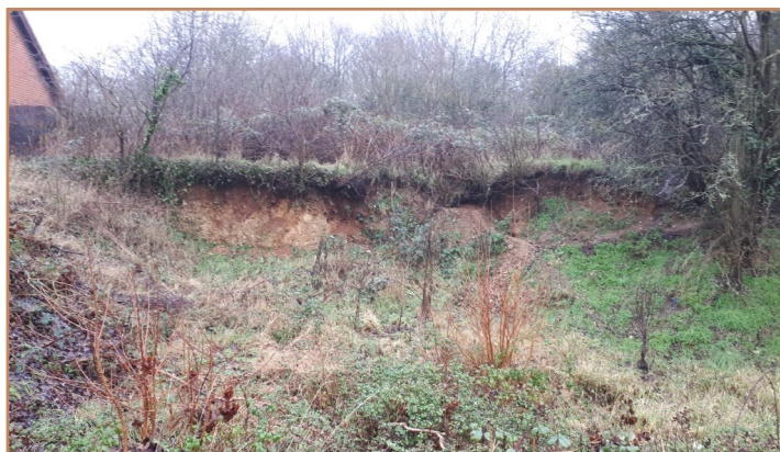
Biddenham Gravel Pit SSSI during condition monitoring (January 2021).

The only site in Bedfordshire that was on the list to monitor was Biddenham Gravel Pit. From the designation paperwork Natural England have the site described, thus: