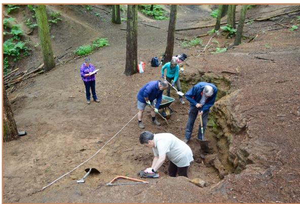
2021: Rushmere quarry clearance in progress.

Presentations and guided walks were carried out as part of the annual Greensand Country Festival which is held during the month of May. In 2020 these activities were not able to take place due to the pandemic, but in 2021 we gave two lectures via Zoom, led a guided walk around Ampthill and hosted a stand at Clophill Eco Lodges for fossil and rock identification to which several members of the public attended.