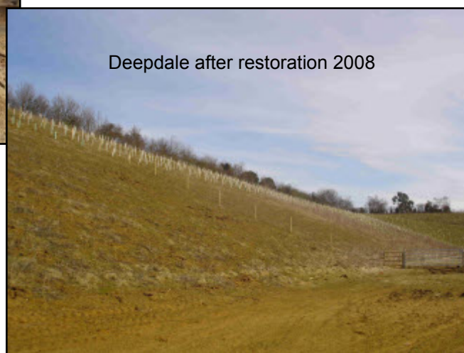
Deepdale after restoration 2008