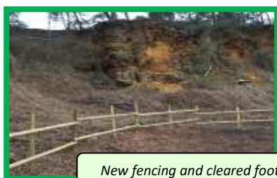
New fencing and cleared footpath

In order to carry out many of our projects, site improvements and access to the sites we are constantly looking for funding. Bev has appealed for support here in her GCLP report on page 5.