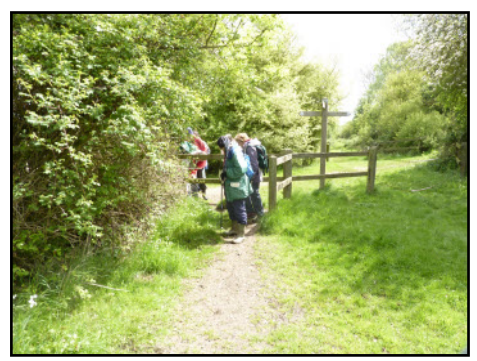
The group pause to enjoy the flora along the Jurassic Limestone Geotrail.

On the back of our first 'Geotrail' publication Jurassic Limestone Villages* , Peter Lally led a small group of members on the 6.5 miles Bromham to Stevington circular walk. The landscape of gentle rolling hills being one that has been sculpted by glaciation, with boulder clay in varying depths of 3 to 30 metres overlying the Jurassic