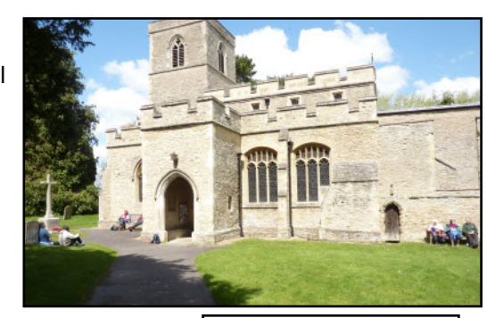
Resting at Stevington Church, above.

I thoroughly enjoyed the walk, the weather was perfect and the company was great too!