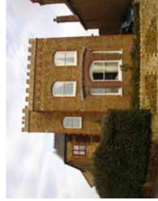
P7. Distinctive 19th Century house built of Woburn Sands sandstone, a private dwelling

P7 This unusual building, Castle House, looks old but was built in the 19th C.