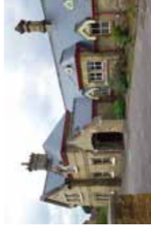
P6. Potton Railway Station, now a private dwelling.

P6 The railway came to Potton as part of the market gardening and coprolite boom of the 1850's, when the industries needed to move fruits, vegetables and phosphate nodules more quickly and further around the country.