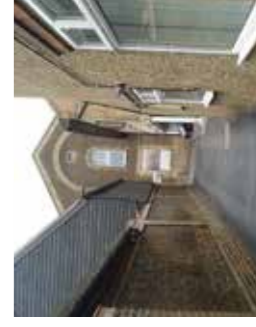
P10. Driveway leading to the old Congregational Hall, now private dwellings.

P10 The last stop on the walk is Congregational Hall, another beautiful sandstone structure that is distinctly in the Potton herringbone style of construction.