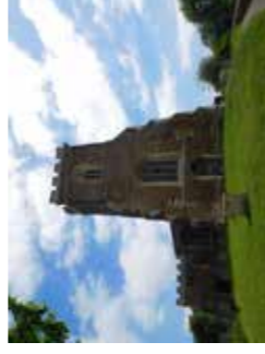
P1. St Mary's Church

Potton is a small market-gardening town with a wealth of sandstone buildings and a heritage of industrial geology. During Victorian times, Pottonians engaged in the coprolite industry. Coprolites (phosphate nodules) were extracted from around the village and exported for use in fertiliser.