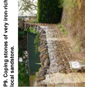
P9. Coping stones of very iron-rich local sandstone.

P9 The garden wall in Horne Lane shows some very unusual iron-rich sandstones that appear almost black, indicative of the geology around Potton. The iron is thought to be from a superplume event (a massive under water volcanic eruption) that occurred 125 million years ago depositing enormous amounts of iron into the oceans creating iron fertilisation and a huge change in global environments. Hence, iron-rich sandstones that we see across Greensand Country.