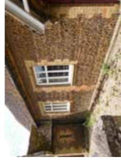
P2. St Mary's Church Hall showing herringbone sandstone construction

P2 The church hall shows the distinctive herring-bone pattern of construction using the thinner beds of local sandstone. Other buildings around the village show this pattern P4 , amongst other more conventional styles P3 and P8 .